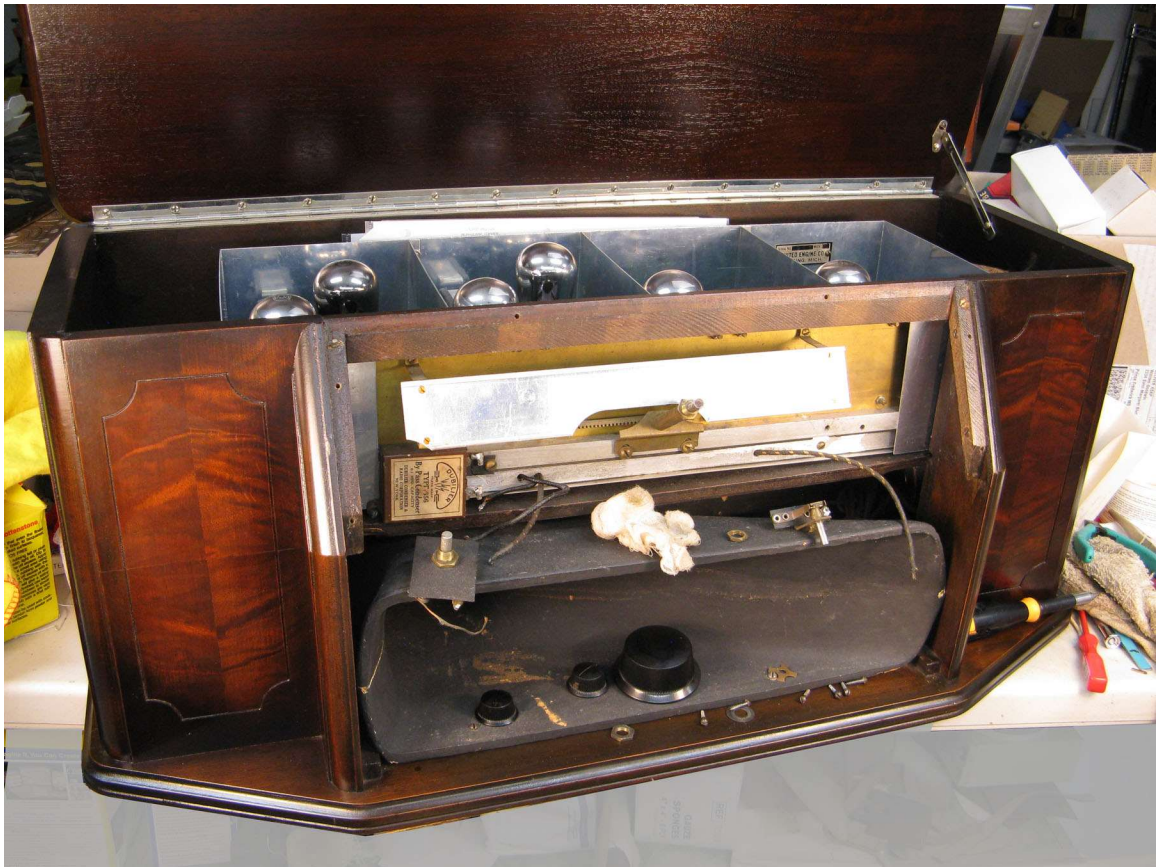
Rack & Pinion drive of straight motion interleaved capacitor vanes.